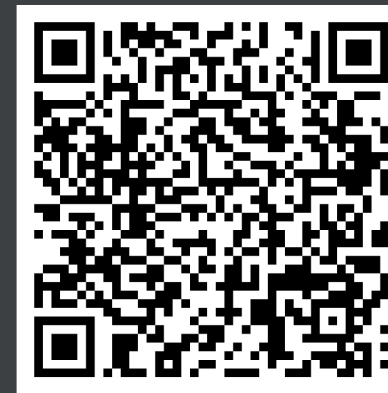
CA.GOV INSURANCE AND ELIGIBILITY REQUIREMENTS