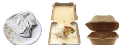
UNCOATED SOILED PAPER PAPEL SUCIO SIN RECUBRIMIENTO MARUMING PAPEL NA WALANG COATING