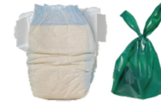
DIAPERS AND PET WASTE PAÑALES Y DESECHOS DE MASCOTAS