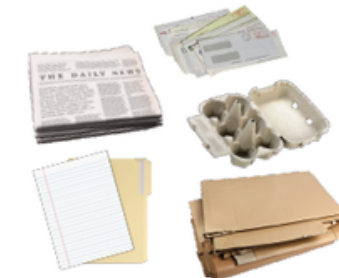
PAPER AND CARDBOARD PAPEL Y CARTÓN