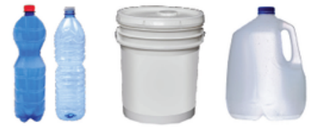
PLASTIC BOTTLES, TUBS AND JUGS BOTELLAS, BALDES Y JARRAS DE PLÁSTICO