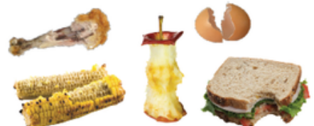
FOOD SCRAPS RESTOS DE COMIDA MGA TIRANG PAGKAIN

Recology.com Waste American Canyon WASTE ZERO