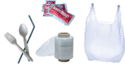
SINGLE-USE PLASTIC PLÁSTICO DE UN SOLO USO