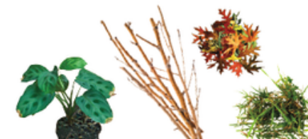
YARD WASTE DESECHOS DE JARDÍN BASURA MULA SA BAKURAN